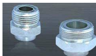
Rotalock Male Tube Connector