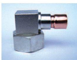
Rotalock Elbow Connector