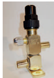
Capped Line Valve - Solder with Access Port