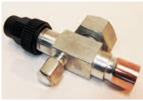
Rotalock Receiver Valve (Single Access)