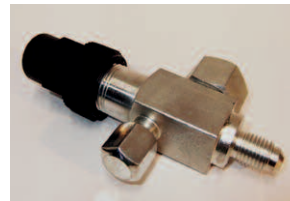
Rotalock Valve Flare