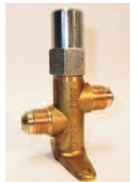
Capped Line Valve - Flare

Manufactured in accordance with AS1677.2, Mueller-UL and CE