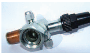
Rotalock Service Valve (Dual Access)

Manufactured in accordance with AS1677.2