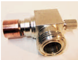
Rotalock Male Elbow Connector c/w Access