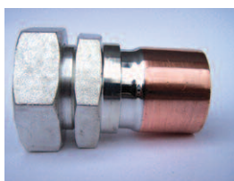
Rotalock Straight Connector