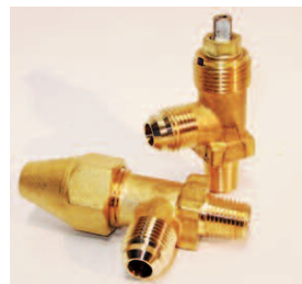
Capped Line Valve - Flare / MNPT