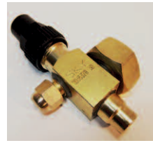
Brass Rotalock Service Valve (Single Access)