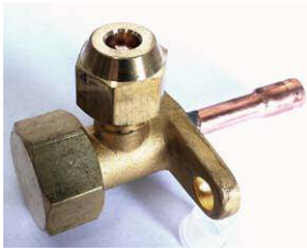
Capped Line Service Valve - (right angle)