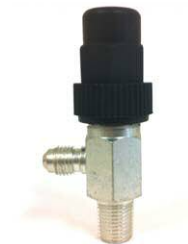
Capped Line Valve -Flare/ MBSP