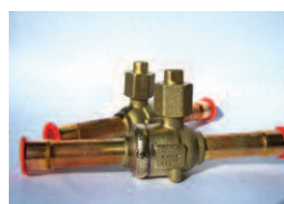
Ball Valve, Standard