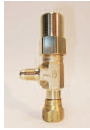
Packed Line Valve (Swivel)