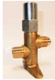
Capped Line Valve -Flare/ Solder